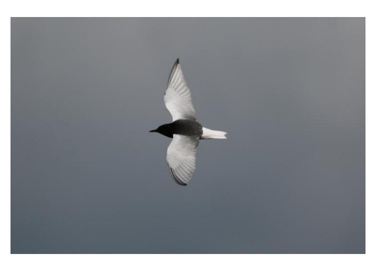
White-winged Black Tern (DSLR)

After another hearty breakfast we packed up, settled with Zenon and headed north along the west bank, retracing our steps from the previous evening. Thrush Nightingales were surprisingly thin on the ground throughout the trip, only just arriving back, so when we heard one singing close to the road as we drove through Mocarze I pulled over and we spent some time trying to locate it in some