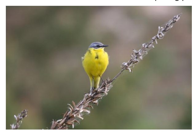
Blue-headed Wagtail (DSLR)

we could not approach very closely on foot, but crouching and squatting on the water-logged ground we settled uncomfortably to enjoy the spectacle. 5-6 superb summer plumage male Ruff and several Reeve were wandering about feeding, along with Dunlin, Grey Plover, Spotted Redshank (all in smart summer plumage), Wood Sandpiper, and marsh terns -- hundreds of White-winged Black Terns, along with smaller numbers of Whiskered and Black. Occasionally one or more of the male Ruff would get excited, puff out their ruff and wings and strut about. Wicked!