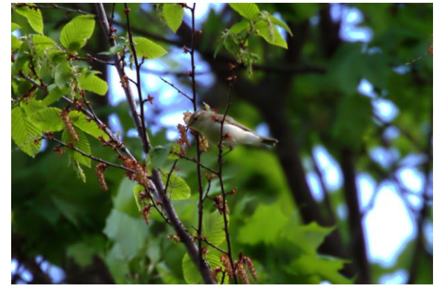
Greenish Warbler, Palace Gardens