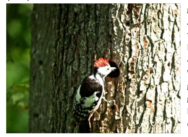
Middle-spotted Woodpecker (videograb)

We now returned to the bridge near Budy to stake out a fresh-looking nest hole we'd seen that Lukasz confirmed was occupied by a pair of Middle-spotted Woodpeckers. We stationed ourselves quietly with a decent view of the hole and waited. Soon after we saw some movement in the hole,