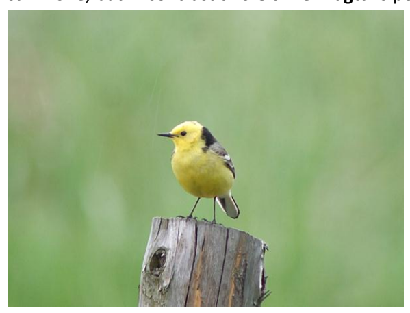
Citrine Wagtail (digiscoped)

Next stop, between 3 and 5pm was Msichy, another well-known Aquatic site, but with that in the bag a quarry here were Bluethroat and Citrine Wagtail. Though fairly sure we heard the former, we saw none, but in contrast two Citrine Wagtails performed beautifully, ably supported by a cast of