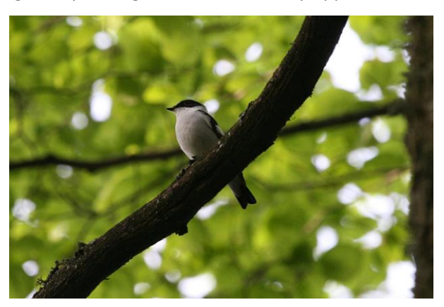
Collared Flycatcher (DSLR)

hotel. Various common warblers were singing away in the late afternoon, the least "British" of which was a Great Reed Warbler . We added various other common species but were keen to see at least one of our targets before our dinner back at the hotel, which we had booked for 6pm. Fortunately in a more wooded area we found a cracking male Collared Flycatcher which obliged for our first photographs of the trip. Another posed on the fence near the main entrance to the park as we departed.