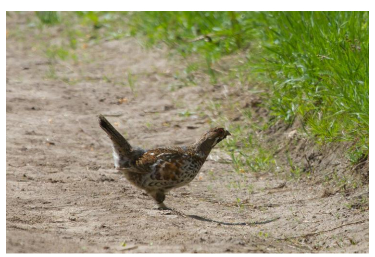
Hazel Grouse at Wysoki Bago