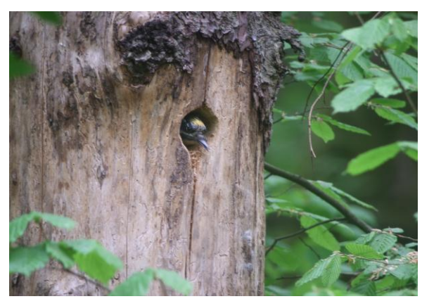
Male Three-toed Woodpecker, Strict Reserve (digiscoped)

Unfortunately by now cloud had drifted over and what had started as a sunny, still day, was morphing