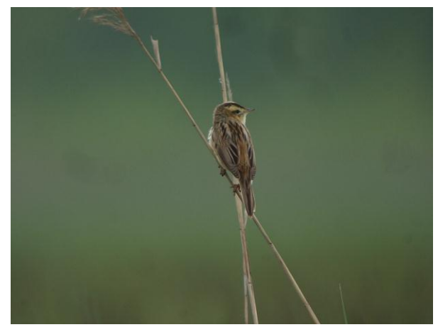
Aquatic Warbler (digiscoped)

Success with the Aquatic convinced us to take it fairly easy and celebrate with a meal at the Dobarz Restaurant, just up the road. Our timing