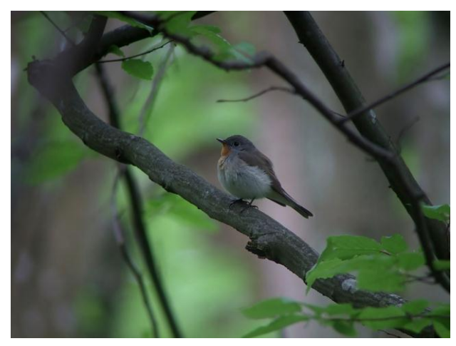
Red-breasted Flycatcher (digiscoped)

returned with the good news that another of our main targets had arrived the previous