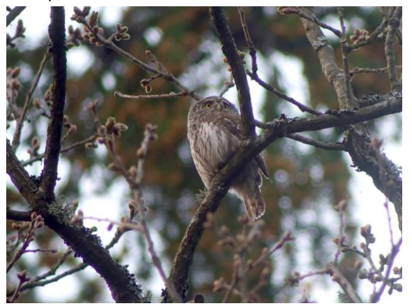
Pygmy Owl (digiscoped)

were met by Arek, whom we had booked to go looking for Pygmy Owl this evening. We drove a short distance out of the village then south onto a track (Sinicka Droga) before pulling up in a parking spot near the old railway line. Walking deeper into the forest (and encountering our first of the mosquitos that were to make life uncomfortable for the next few days) we immediately heard the