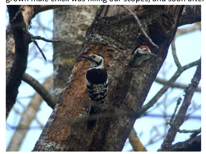
White-backed Woodpeckers (digiscoped)

Arek suggested a 4.45 start, and eager to take advantage of the dawn we made sure we were ready when he arrived on his bike at sparrow-fart. We began with a quick drive around the village and then through Teremiski hoping that some Bison were out in the fields, but there was no sign so we carried on to our first main site, just south off the main road to Hajnowka (Zielony Tryb). A short walk into the forest with Wood Warblers singing every which way included some great views of this lovely Phyllosc , but we could hear a woodpecker calling and didn't pause for photos. Arek pointed out a hole high up in a dead tree and within a few minutes the protruding head of an almost fully grown male chick was filling our scopes, and soon after a female White-backed Woodpecker visited